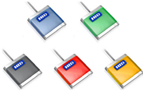
Color options / Accessory pack